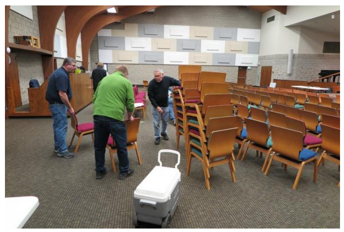
Soon after the last item sold, the clean-up crew was hard at it putting the church areas back together.