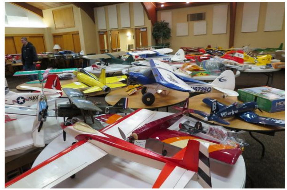
This photo is only a part of the airplanes in the main impound room. IN addition, two other rooms were chocked full, plus the stage had the larger ones for sale.