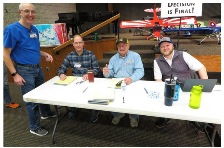
Before it reached the auctioneer, an upcoming item had to get buy this crew.