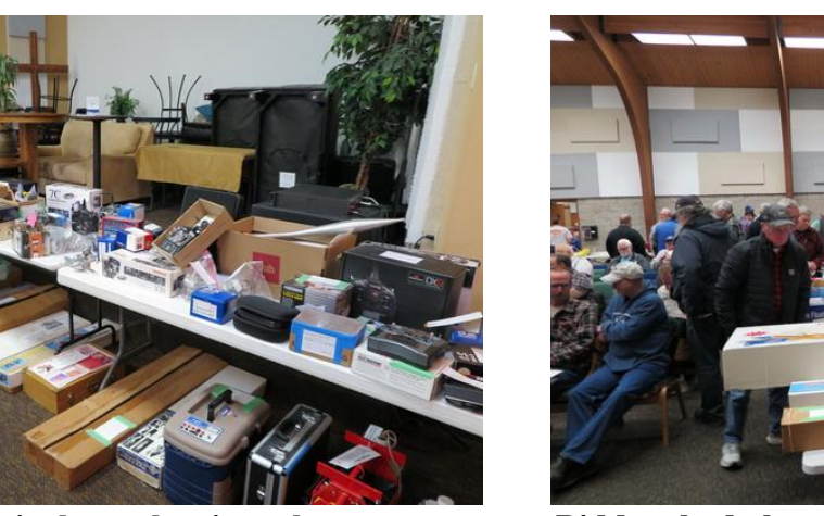
It Wasn't just airplanes, but just about every accessory you could think of was for sale.