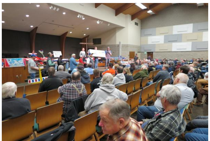
Although the room was full, you always had a good view of the auction action.