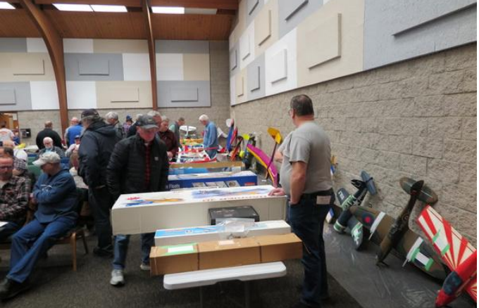
Bidders had about a 45-minute warning when an item was going to appear on the auction block.