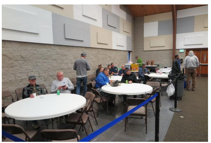
The concession area allowed people to enjoy a meal and still partake of the auction action.