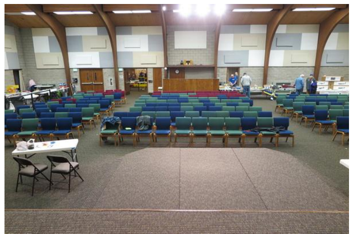
The calm before the storm! The main auction room set up and ready to go.