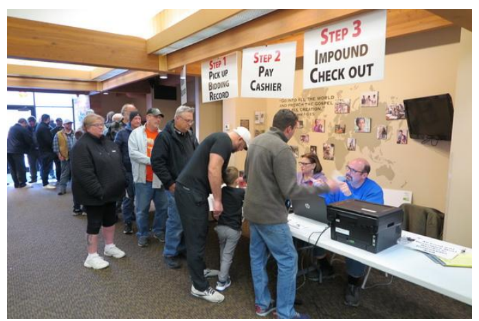
The Cashier area was a pretty busy place at the end of the auction.